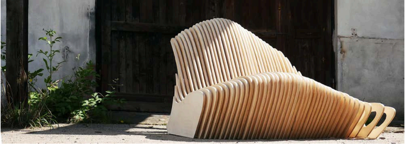
Figure 2: The digitally fabricated model of urban furniture created with parametric design at a 1:1 scale (Supervisor: J. Cudzik, FA-GUT).

The students had to learn the basics of parametric design, develop the final form from a possible mix of putative solutions, and then develop the entire fabrication process. The outcome of this short design studio was a bench with an additional bike rack that was inspired by the shape of a wave. After creating the first prototype, the students evaluated the proposed form, discussed what could have been done differently, and then incorporated conclusive remarks into the software script with which the final form was created (Figure 2).